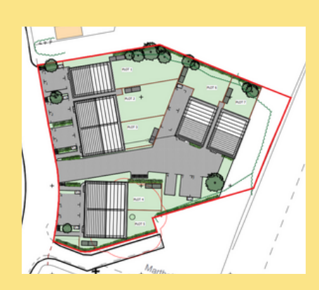
Mermaid Hotel, Handforth

Change of Use of existing cafe to a public house, including internal and external alterations, new signage