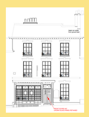
Zetland Arms, Warwick

Redevelopment of existing public house for 16 affordable dwellings