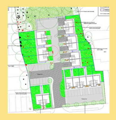
Sportsman Arms, Penketh

Within the second quarter of 2022, we were granted the following six planning permissions, including: