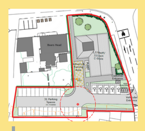
Boars Head, Warrington

Change of Use of Grade II Listed public house to one dwelling with internal reconfigurations